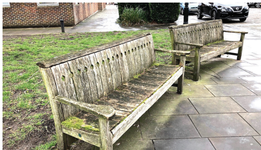
Abbey Benches (above) Round Seat (below)