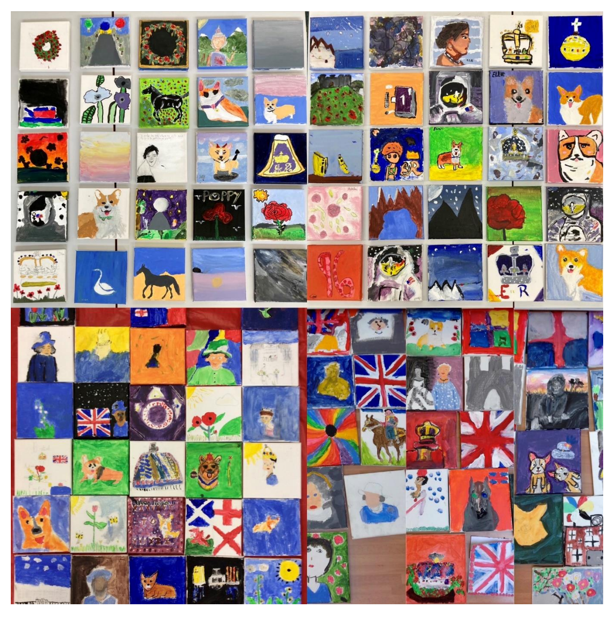
Mini canvases painted by schoolchildren and members of the public at workshops across Andover